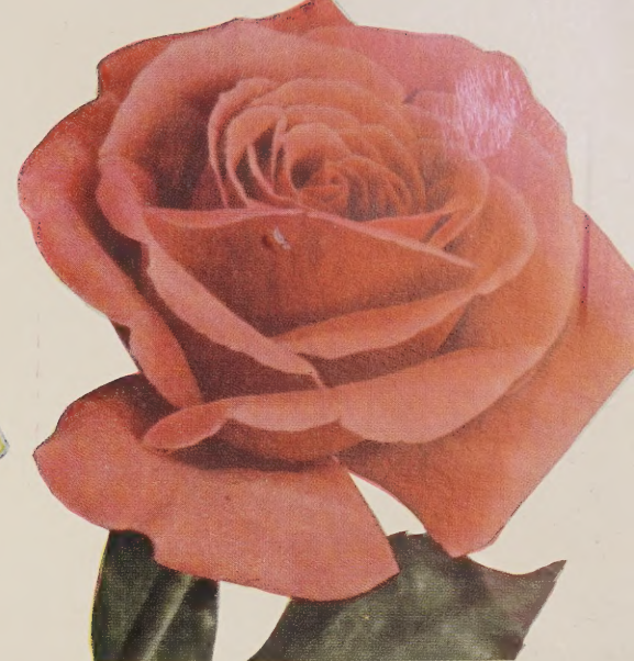
TALLYHO (Pat. applied for)